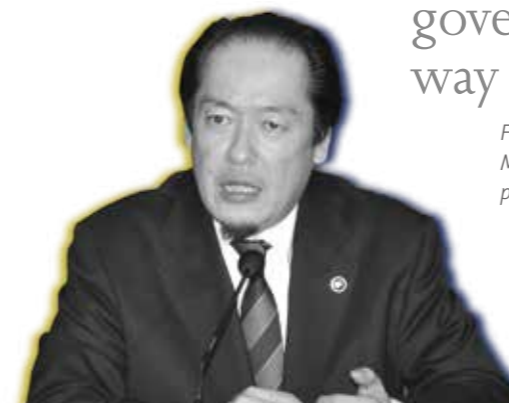
Futoshi Toba, Mayor of Rikuzentakata, page 10

“There are several reasons why the reconstruction work is so slow, but the biggest problem is the government's way of thinking.”