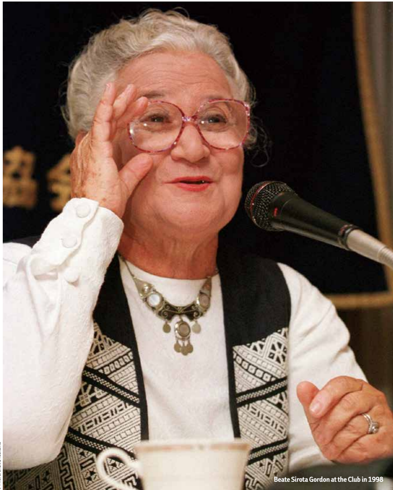
Beate Sirota Gordon at the Club in 1998