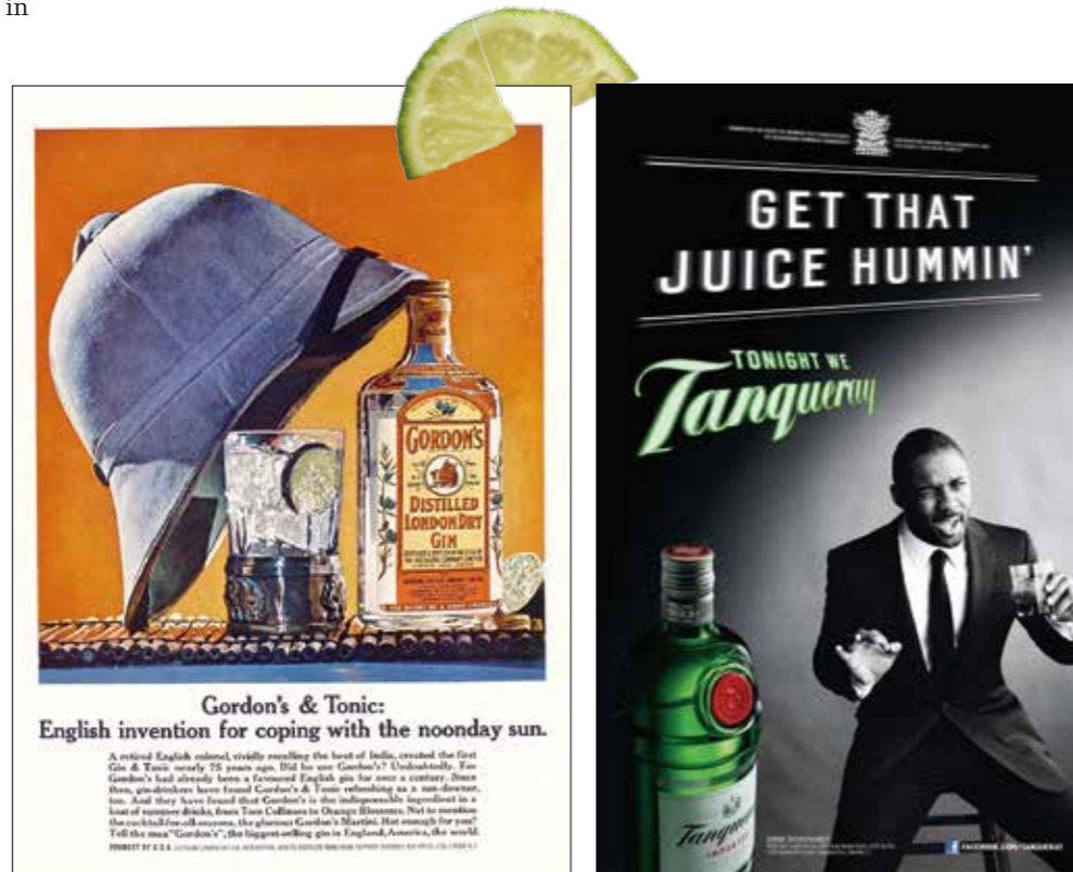
Stiff upper lip to soulful sips: An ad in a 1963 issue of Playboy celebrates the drink's colonial origins; a half-century later, distillers shun the past for a more youthful, trendy approach.

but the version we enjoy today has its true roots in the popular Dutch drink gen – a popular grain distillation from the coniferous juniper plant ( genever in Dutch), long known for its medicinal properties. Records exist of a Dr. Sylvius de Bouve in Leiden, who had a best-selling juniper remedy for inflammation and kidney ailments in the 16th century.