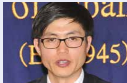
Shin Dong-hyuk: Former Inmate of North Korea's Notorious Camp 14, Jan. 27.