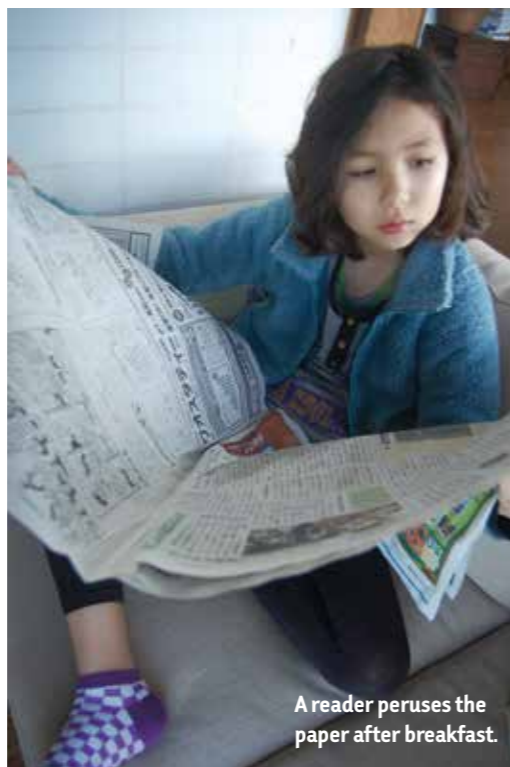
A reader peruses the paper after breakfast.

where the next reader is going to come from. Matsumura also credits the education ministry, which three years ago revised its guidelines for school teaching materials to include newspapers. Like many educators, the ministry's bureaucrats blame the internet and video games for a national decline in reading ability.