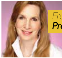
From the President

LAST MONTH SAW A remarkable flourish of activity at the FCCJ. After nine months of negotiations, we finally inked an agreement with Mitsubishi Estate to move four blocks into a new building complex in the central Marunouchi district which will be ready in 2018. There is a skyscraper of work ahead, but this a good chance to raise a virtual toast to our hard-working House & Property Committee that is leading the charge.