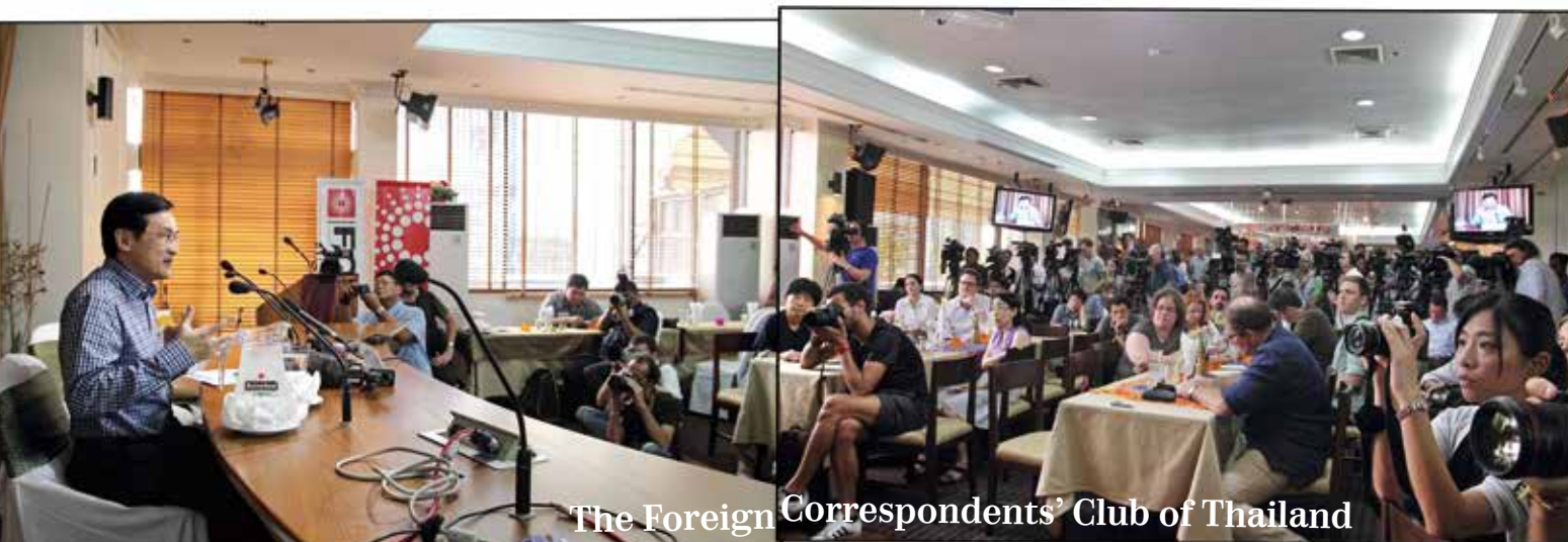
The Foreign Correspondents' Club of Thailand