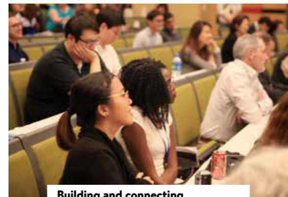
Building and connecting