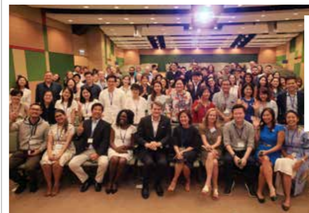
Page 6: Attendees from the American Asian Journalists Association's Asia chapter's N3Con at the University of Hong Kong