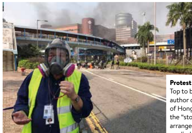
Protest and survive Top to bottom: the author on the streets of Hong Kong; the “stonehenge” arrangement of bricks readied for throwing; Hong Kongers call for a “free Hong Kong”; a protester holding the symbol of the protests—an umbrella