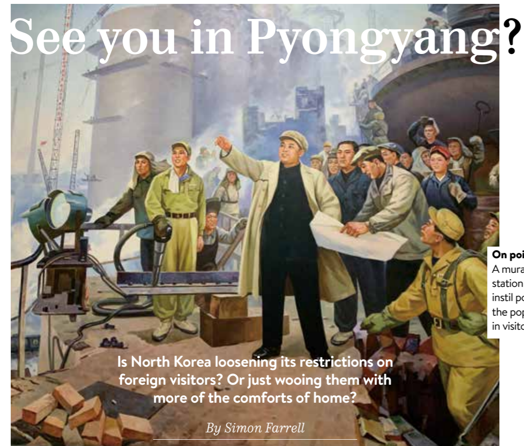
On point A mural in a train station aims to instill positivity in the populace—and in visitors?

Could North Korea's bullish tourism slogan of "See you in Pyongyang" mean the secretive dictatorship is warming to visitors?