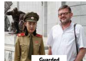
Guarded The author at the border

Then there's the Victorious Fatherland Liberation War Museum—an eerie monument to perceived injustices and victories. You are seated on a moving 360-degree journey around a movie-set-like bloody battleground, with graphic exhibits of captured enemies' personal and military items.