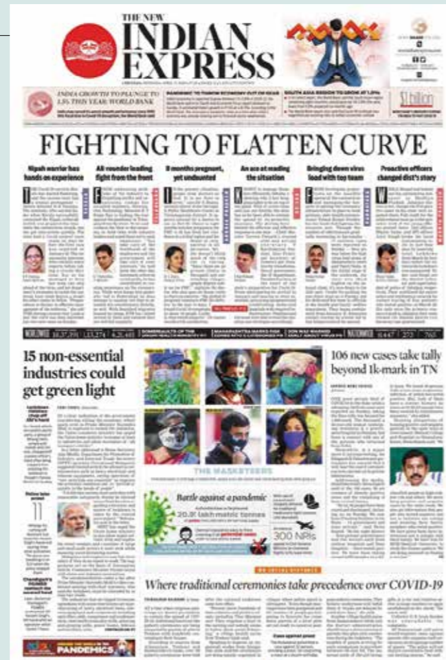
India: Managing infection and country-wide lockdowns (April 13)