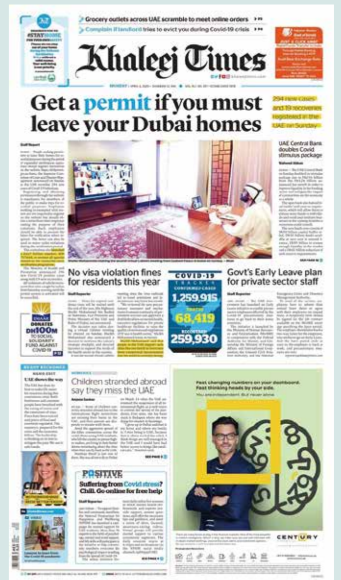
Dubai: Permits needed to leave home (April 6)