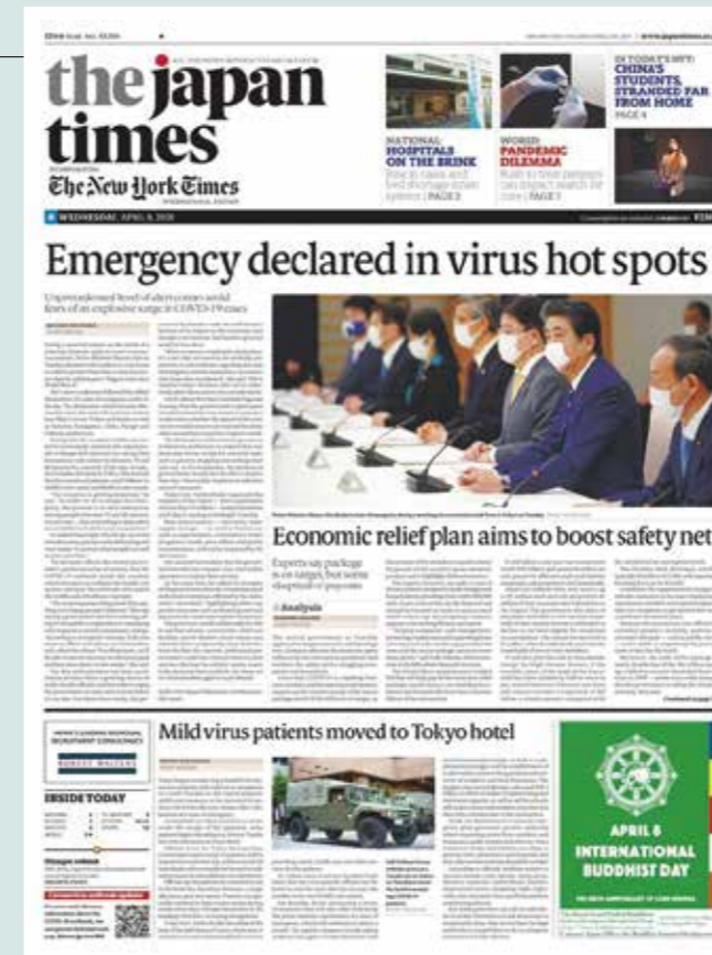
Japan: Emergency declared for a largely voluntary lockdown (April 8)