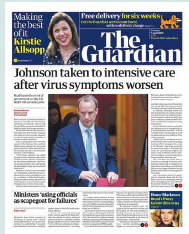
UK: PM taken to intensive care and a week in hospital (April 7)