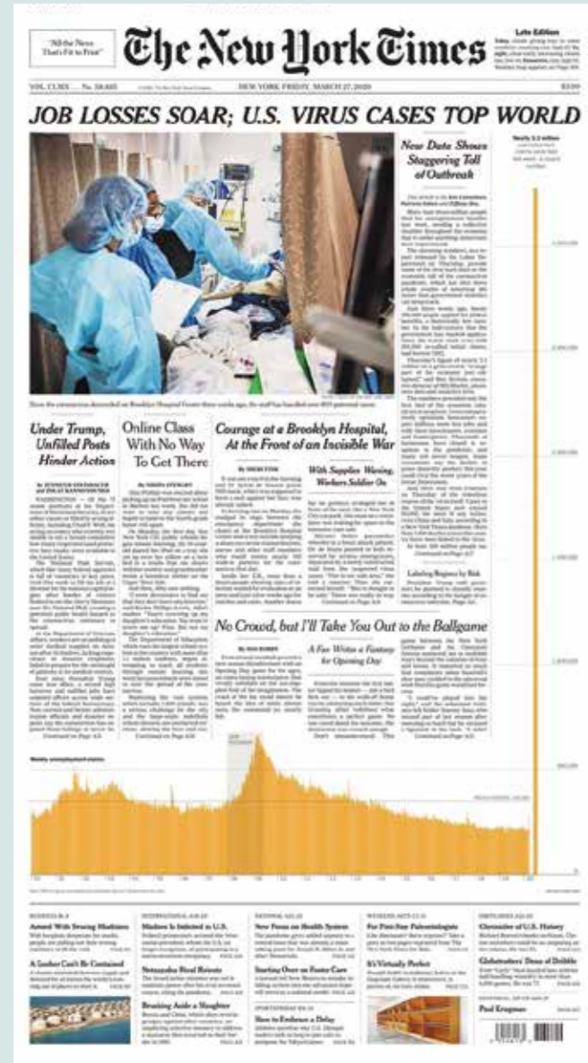
USA: World leader—in virus cases and unemployment, graphically represented on their broadsheet front page (March 27)

Reporting—and trying to understand—the spread of Covid-19 dominated the news globally. While the news industry suffered threats of closure and staff furloughs like other industries, more and more people were getting their news online, even as online ad revenues plummeted. Here are some front pages of print editions from around the world—a glimpse of the coverage and its importance.