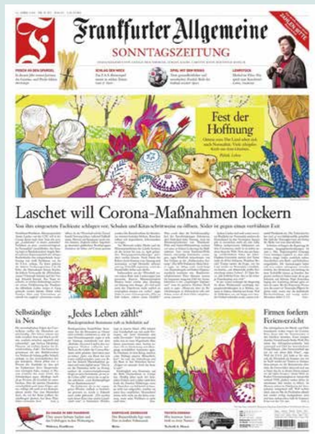
Germany: Looked to loosen lockdown and toward hope (April 12)

Disagreements between Koike and Abe over how far the emergency measures should go have quickly escalated since Tokyo's 14 million residents were asked to stay home earlier this week amid record numbers of new cases. "Asking for residents to use self-restraint and stay home is not enough," Koike said soon after Abe declared a state of emergency this week. "We should also restrict the use of cluster-causing facilities" such as restaurants and karaoke parlours, she said.