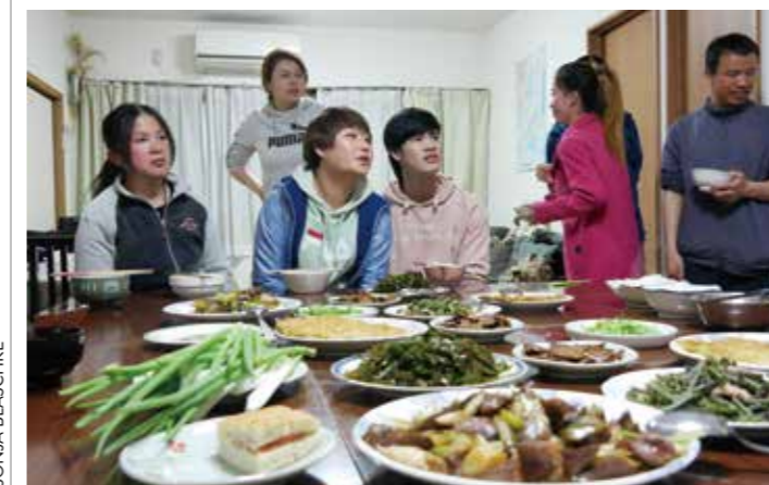
Page 6: Shelter for foreign trainees