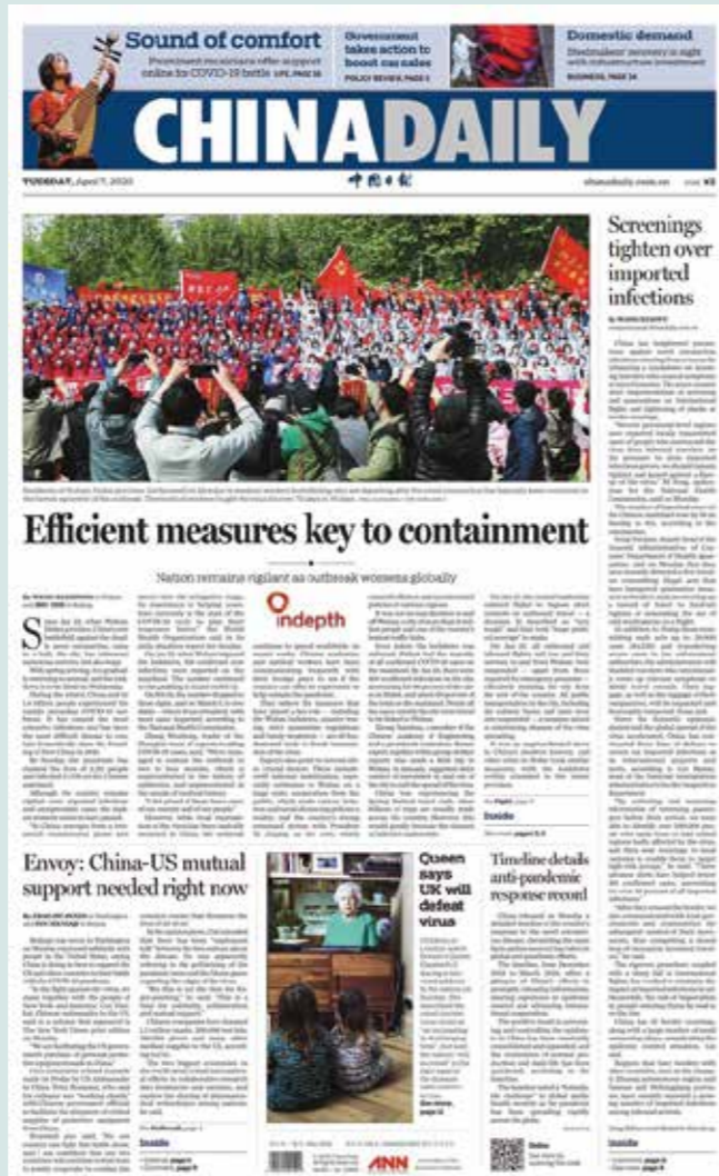
China: World leader in containment? (April 7)

To an extent that no one would have expected a month ago, Japan is the best place to be among any of the big industrialised nations, for the time being at least. It is difficult to explain and frankly difficult to believe in. As terrible news comes in from the rest of the world, Japan feels like a fairyland into which grim reality is liable to explode at any moment.