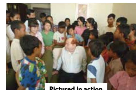
Pictured in action

From top: a comic book-style feature showing a teenage Bernard Krisher editing his own magazine in 1947;