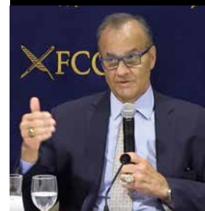
Joe Torre , former NY Yankees manager and MLB executive, March 21

“PLAYING AGAINST ICHIRO IS SCARY. TO SEE HOW MANY WAYS HE CAN BEAT YOU OFFENSIVELY AND DEFENSIVELY IS A FRIGHTENING EXPERIENCE.”