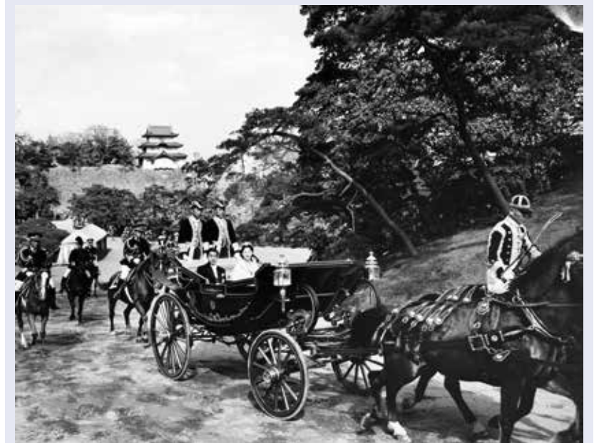
April 10, 1959: The carriage procession at the Prince and Princess' wedding.