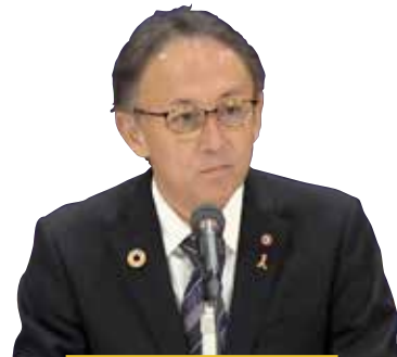
Okinawan Governor Denny Tamaki , March 1

I PERSONALLY BELIEVE THAT THE HUMANITY OF THE HEISEI EMPEROR HAS BEEN DEMONSTRATED IN THE FACT THAT HE’S VISITED US 11 TIMES, HIS WILLINGNESS TO LEARN THE LANGUAGE, THE SONGS. IN HIS HEART, I THINK HE UNDERSTANDS THE JOY AND THE SADNESS OF OKINAWA.”