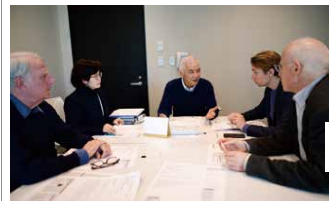
Page 12: The Library Committee