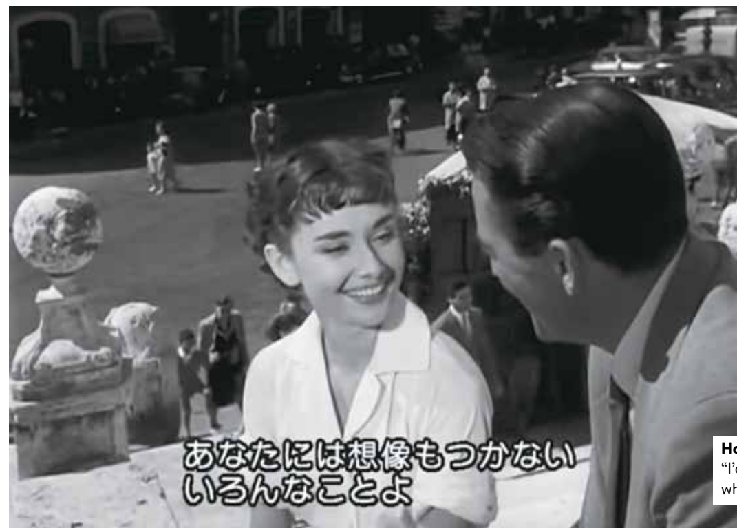
Holiday Romance “I'd like to do just whatever I liked.”

Before the arrival of his guest, Rockefeller sought the advice of Mrs. Elizabeth Gray Vining, an American woman who taught English to the crown prince in the immediate postwar period. It was apparent to many that Mrs. Vining had played a larger role than simply an English teacher, but had served in effect as an adviser to the Imperial family,