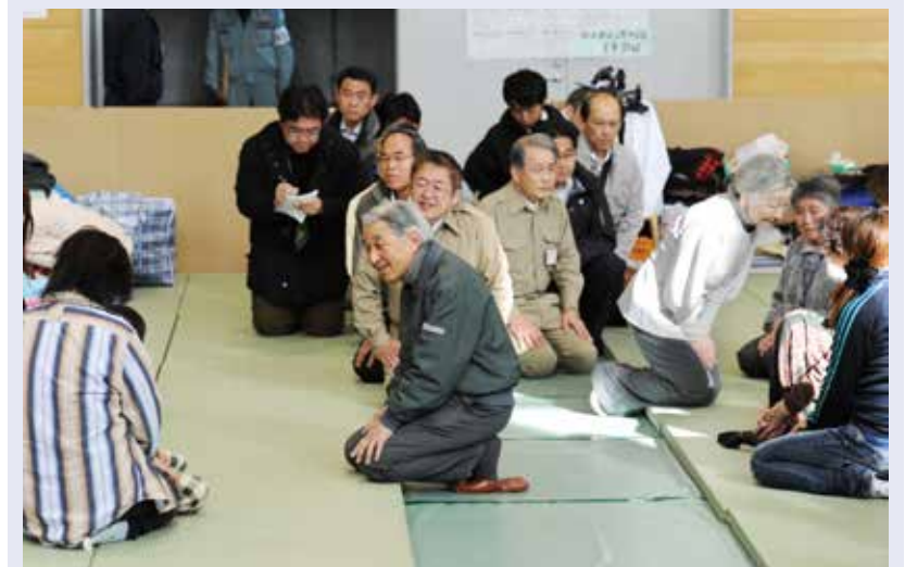
May 6, 2011, Miyako City, Iwate: Emperor Akihito and Empress Michiko visit evacuees in a gymnasium after the 3/11 earthquake.